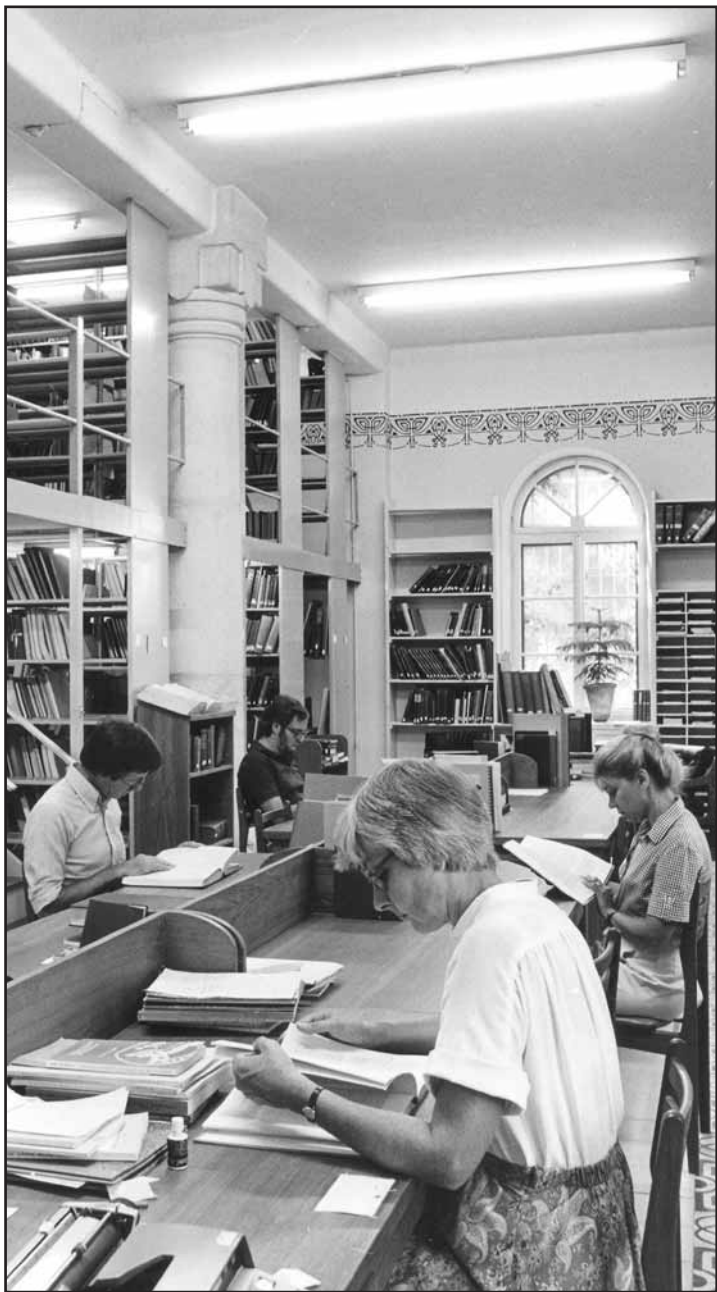
Reading room of the Albright Library 1984