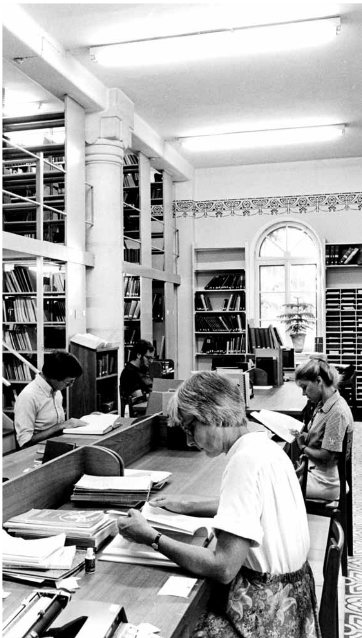
Reading room of the Albright Library 1984