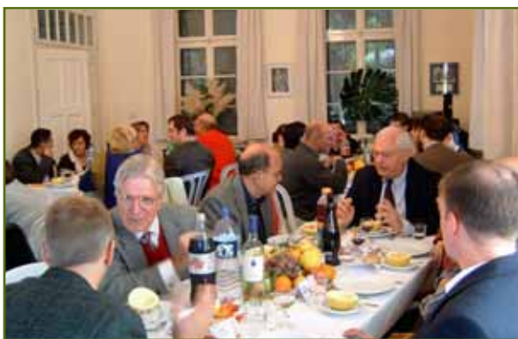
Albright Thanksgiving Luncheon, 2005

Nov 23 AIAR Appointees' Thanksgiving Luncheon. (Thur)