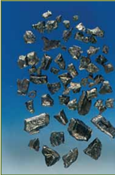
Tel Miqne-Ekron, Cache of Hacksilber, Stratum IB, 7th Century BCE

The project is designed to investigate the growth and development of the Neo-Assyrian Empire, which, in the 7th century BC, stimulated what may be considered the first “world market” in history, and the extensive Phoenician colonization in the Mediterranean basin. Among the key issues to be examined are the development of local and regional economic exchange systems, international trade, cultic syncretisms, radical demographic movements, and administrative systems as tools of imperial policy.